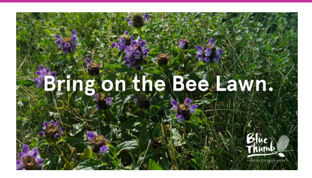
"Planting for Clean Waters" A Resilient Lawns and Shoreline Workshop

Itasca Waters is partnering with Blue Thumb to bring you an evening of information on how to beautify your landscape while planting for clean water and pollinator habitat. There will be a Q&A period after the presentation and take-home templates.